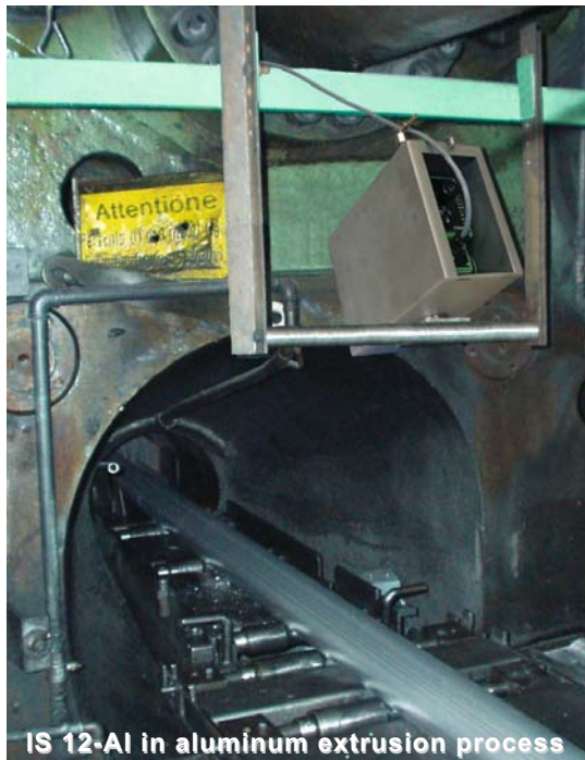
IS 12-AI in aluminum extrusion process

The IS 12-AI is a special development of the well proven IS 10-AI for aluminum applications in temperature ranges between 350 and 1050^\circ\text{C} .