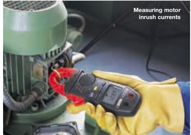
Measuring motor inrush currents

A strong inrush current may set off its safety system or even damage your installation. The "Inrush current" function measures the evolution of the motor's start-up current, without requiring graphic display, and defines the amplitude-time parameters of the motor's safety device.