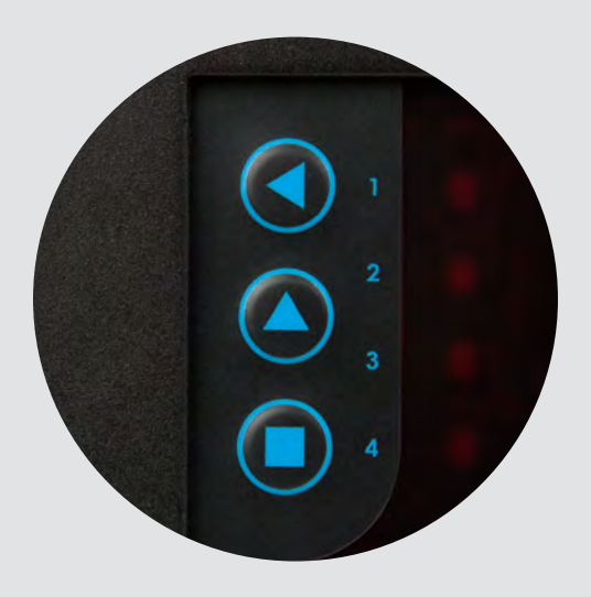
Also available with RKB remote Keypad. Once installed, provides access to configuration menu and control.