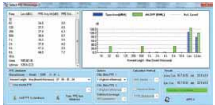
Noise Studio: NS1 “Workers Protection” module; PPE effectiveness analysis.

This application module analyses noise and vibrations in the workplace according to the European directives 2003/10/EC, 2002/44/EC, UNI 9432/2011 and ISO 9612/2011. Sound level measurements and vibration measurements in workplaces are organized in a project where they can be handled and analysed according to standards requirements. The company information, the list of workers and the noise or vibration sources are organized in a database. In addition to calculating the noise exposure of workers the program allows to evaluate the effectiveness of personal protective equipment (PPE) using the SNR, HML and OBM methods (the method applied depends on the presence or not of octave band spectrum on the sound level meter performances). According to UNI 9432/2011, the program also calculates the impulsiveness index of a noise source. The software creates complete reports both for individual worker and synthetic including the company exposition summary. Reports can be exported or printed directly.