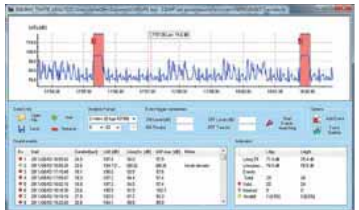
Noise Studio: NS2A “Acoustic Pollution” module; railway traffic noise, 24h analysis with automatic identification of train transits.

Noise profiles detected outdoor, are analyzed in order to search for annoying sources characterized by a sequence of events such as railways and airports. The analysis is performed on a daily basis with a resolution equal to 1/8 of a second and with automated detection and analysis of sound events. This module works on time histories acquired with option “Advanced Data Logger” installed on the sound level meter.